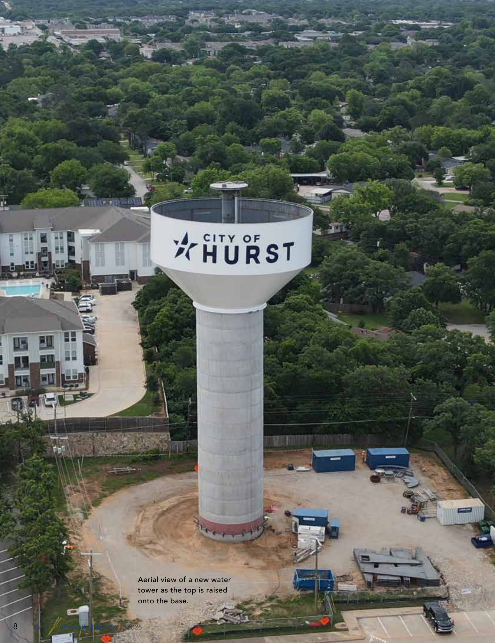
Aerial view of a new water tower as the top is raised onto the base.