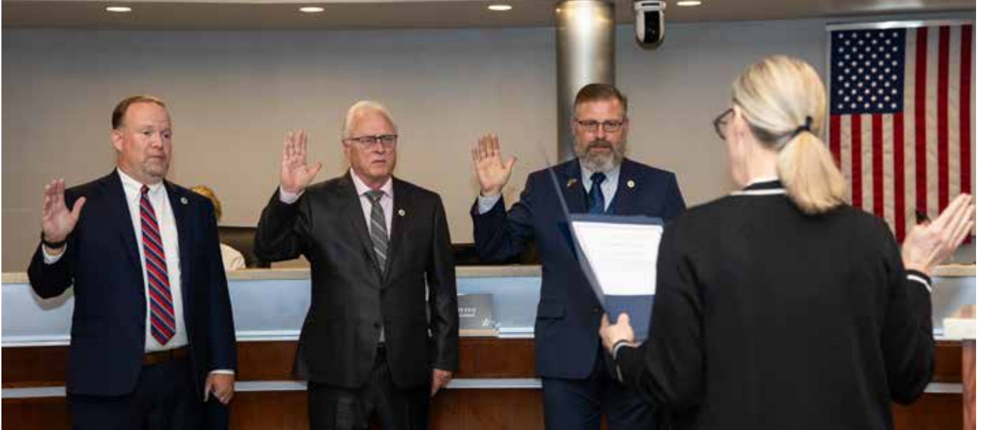
Councilmembers taking oath of office.