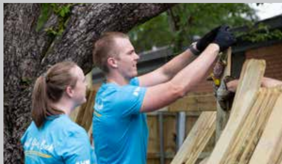
City employees working on replacing fence.