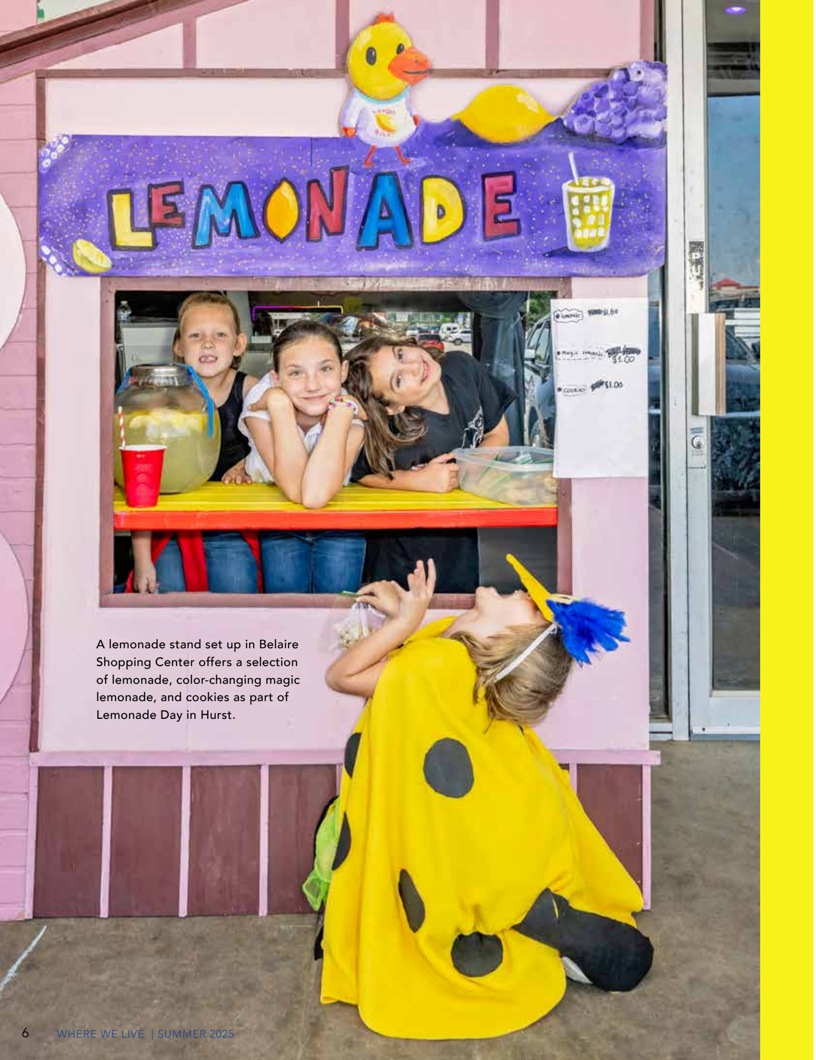
A lemonade stand set up in Belaire Shopping Center offers a selection of lemonade, color-changing magic lemonade, and cookies as part of Lemonade Day in Hurst.