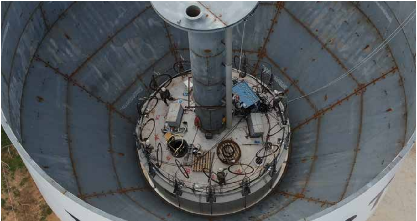
Workers help to raise and install a new water tower on Mary Drive near the Hurst Recreation Center.