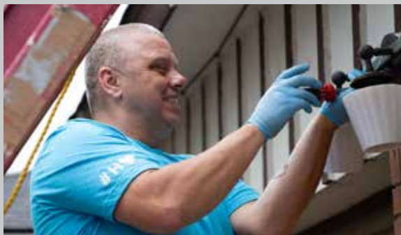
City staff member making a home repair.