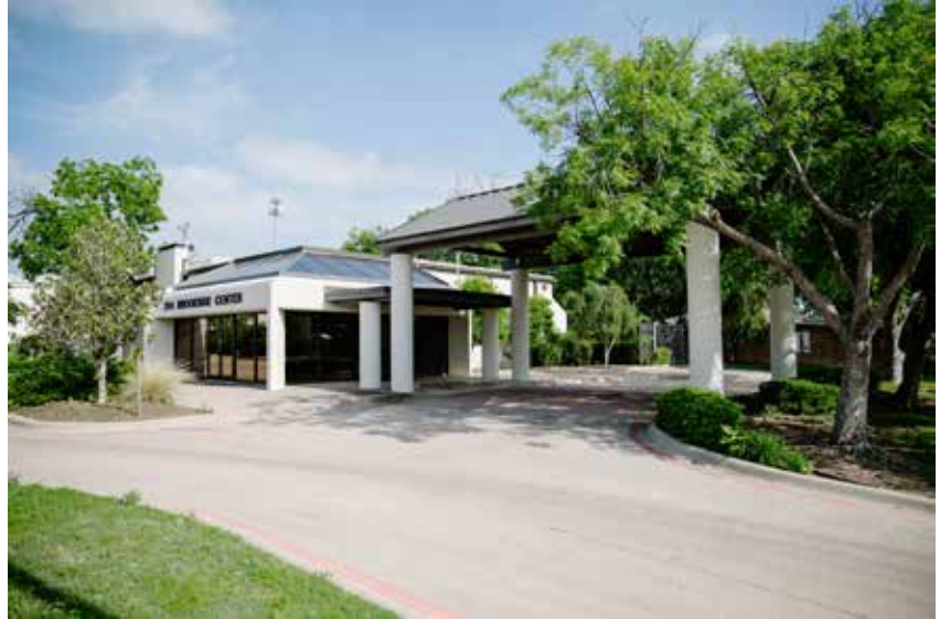
Brookside Event Center located at 1244 Brookside Dr, Hurst, TX 76053.