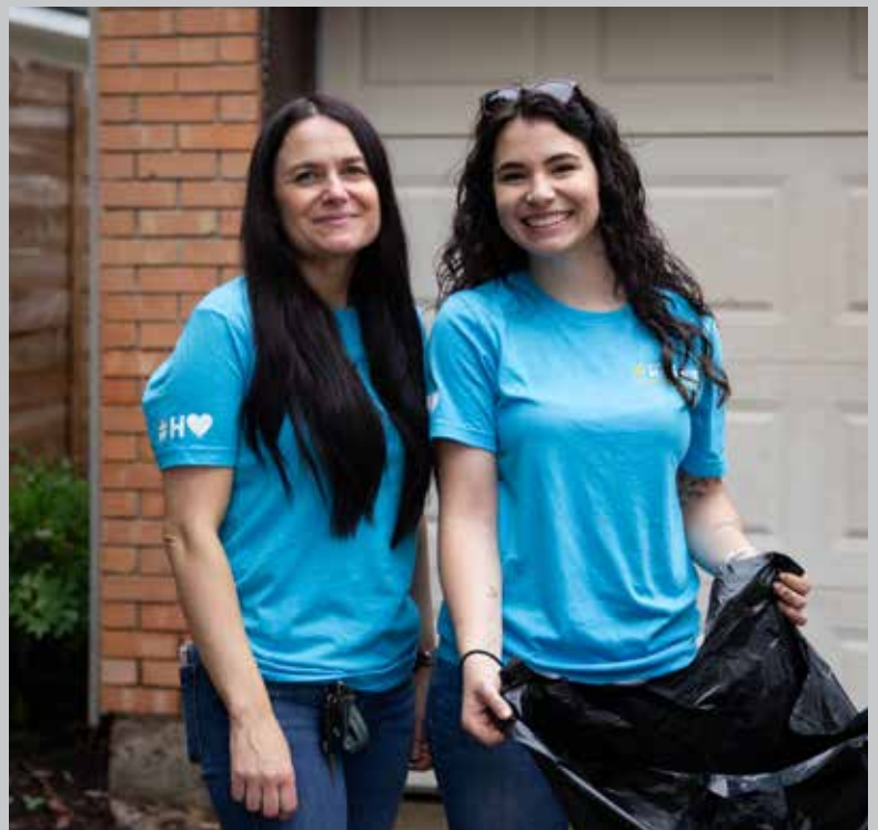
City employees picking up leaves.