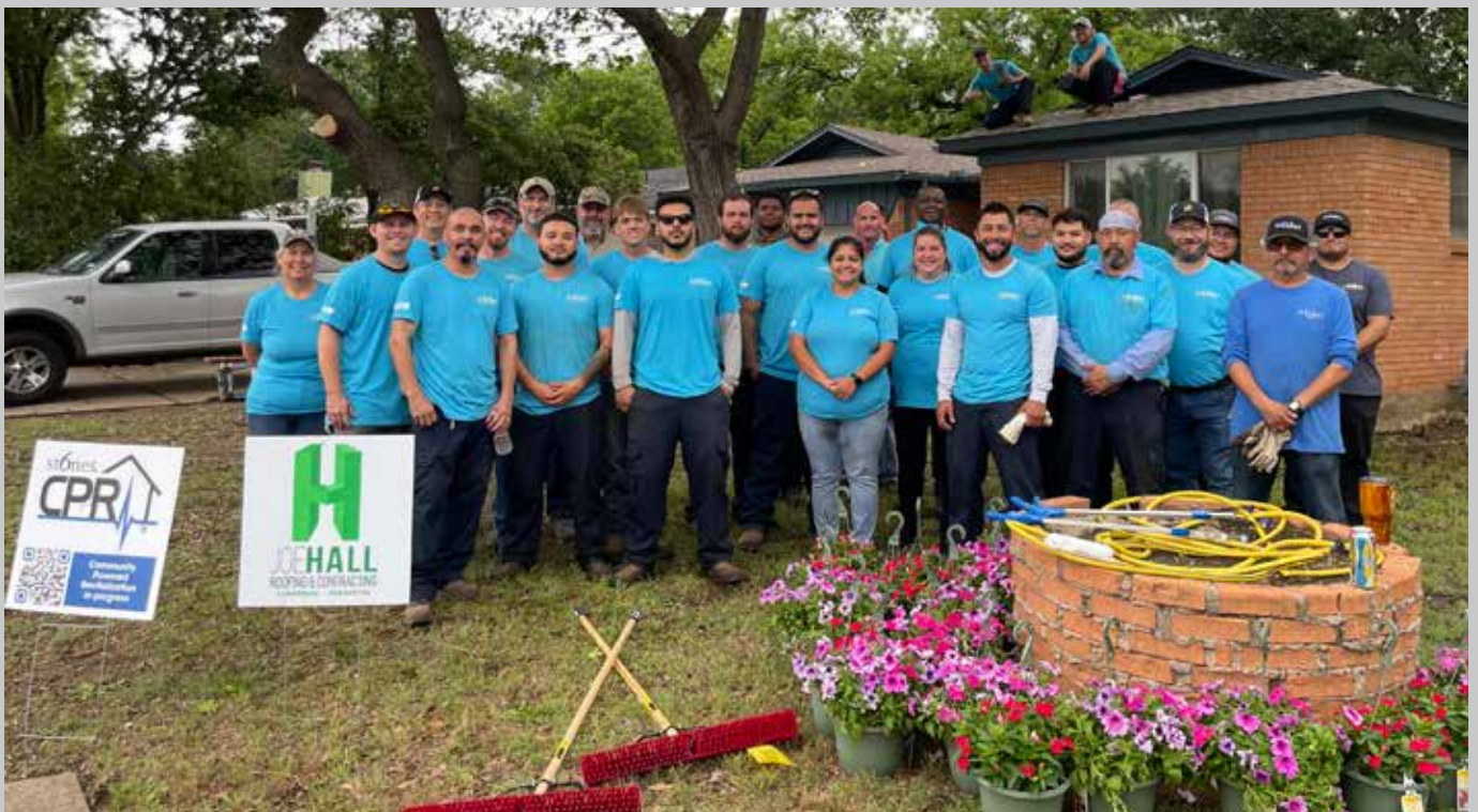
City employees at Hurst Gives Back event.

Over 200 homes in Hurst have participated in this program since its inception! If you or someone you know needs assistance with home maintenance, you can apply at hursttx.gov/CPR .