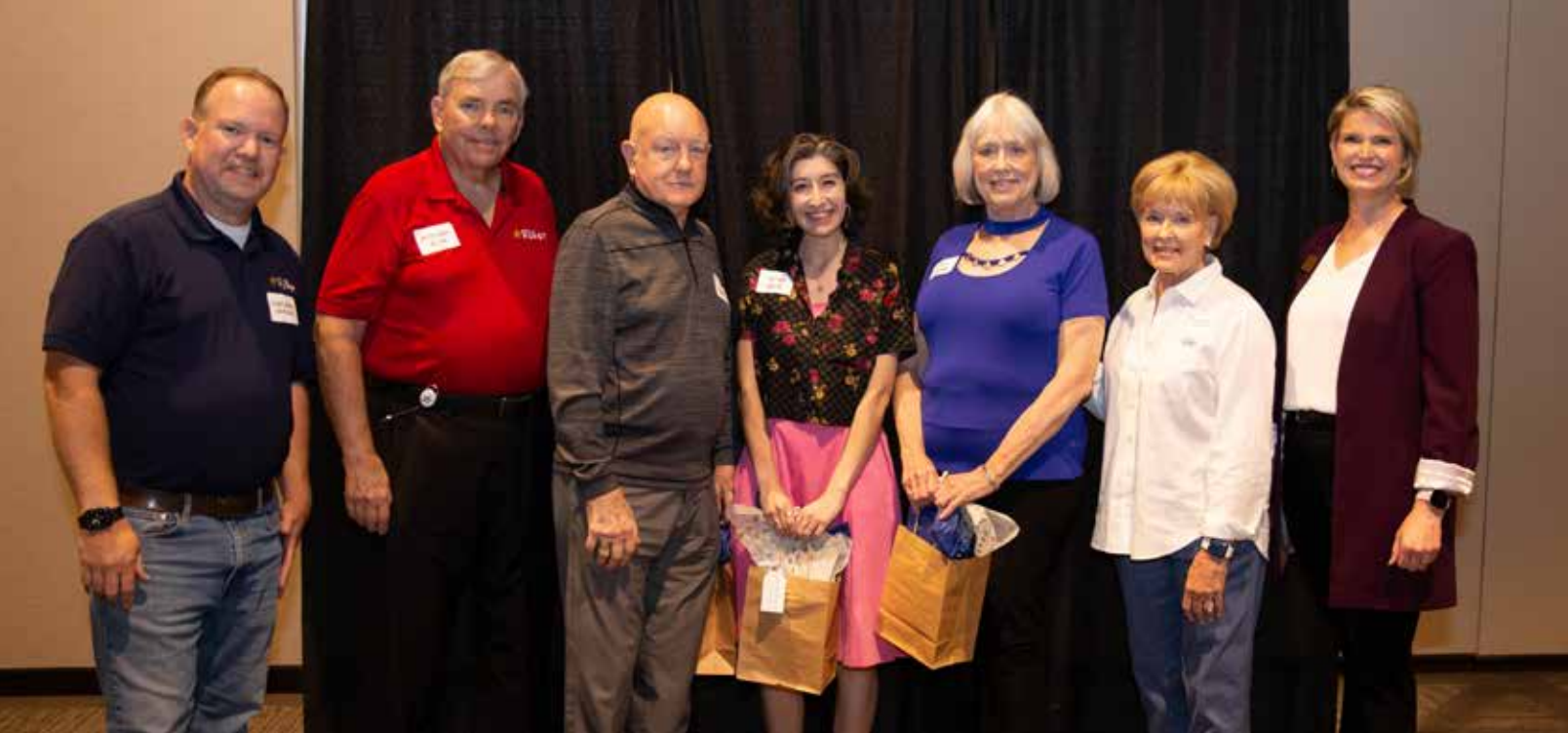
Mayor and councilmembers pose for a photo with volunteers.