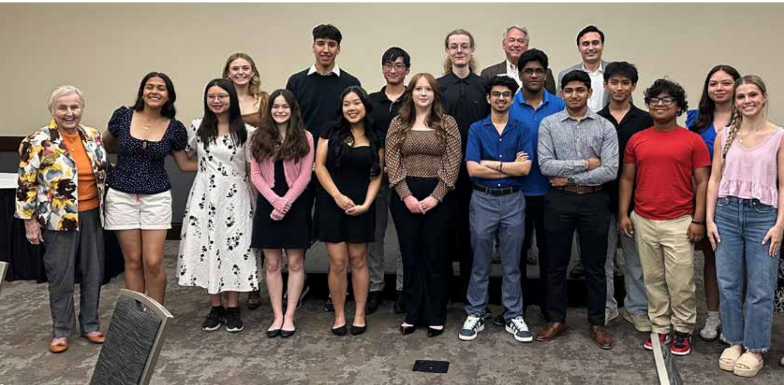
Youth in Government 2025 graduating class.