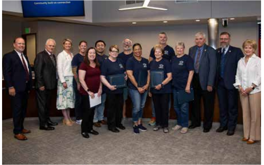
Hurst 101 Citizen Academy 2025 graduates