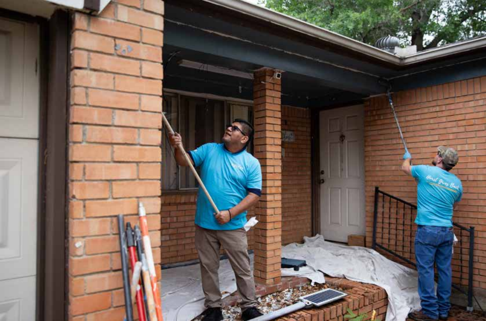
Hurst employees update the trim with a fresh coat of paint.