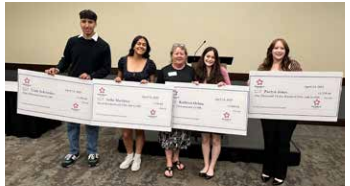
Youth in Government scholarship winners.

Since January, participants have been meeting at various city facilities in Hurst, Eules, and Bedford twice a month, learning about police and fire services, voting and elections, potential career fields, and more! We are grateful for the partnership between the three cities and the HEB Chamber of Commerce to offer this opportunity to local high