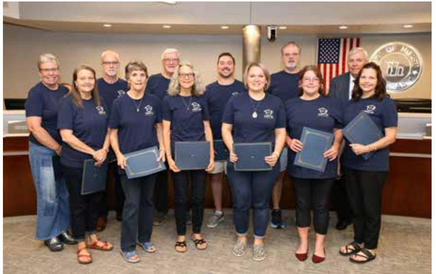
Hurst 101 Citizen Academy 2024 graduates