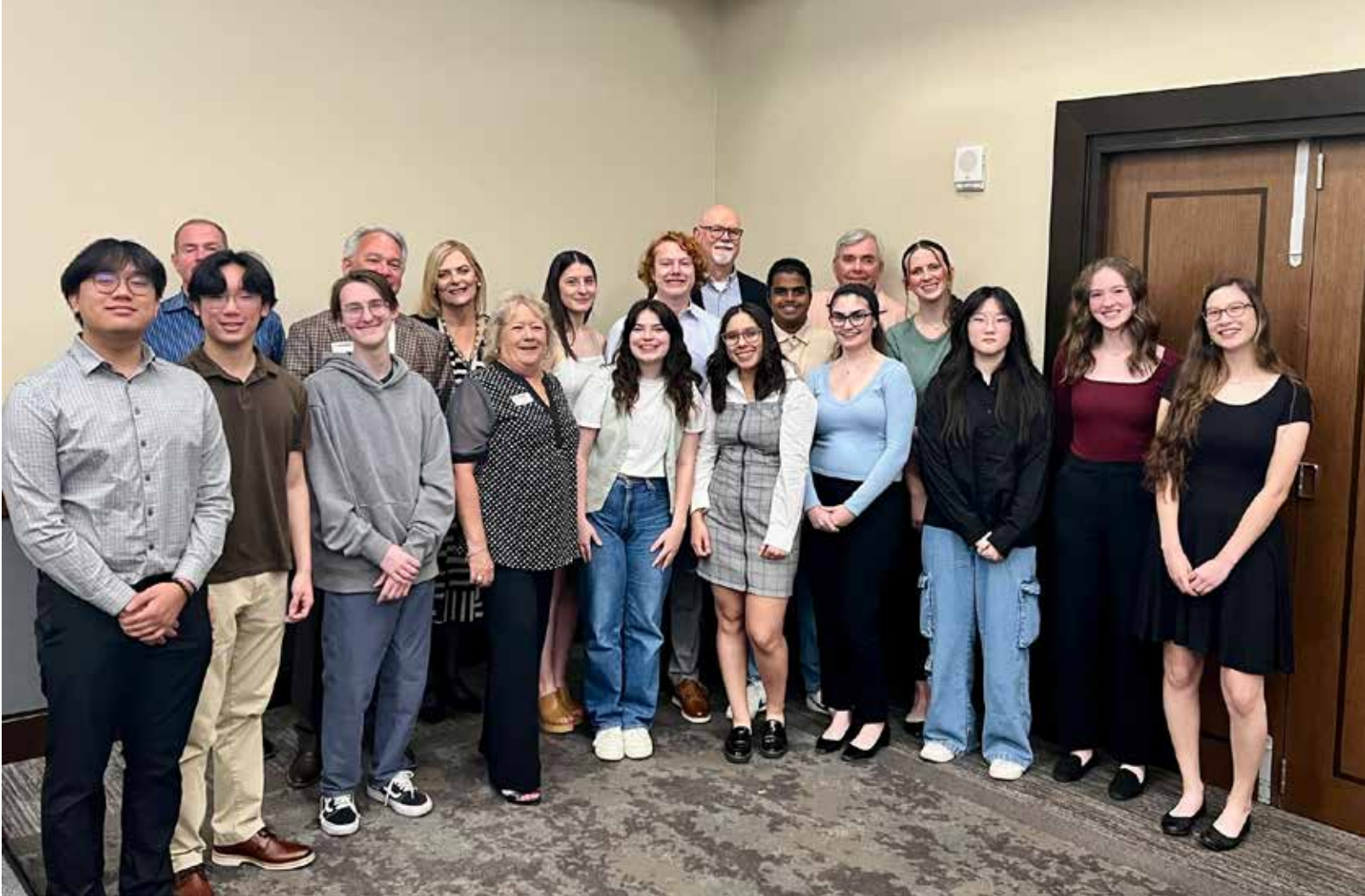
Youth in Government 2024 graduating class with council members from Hurst, Euless, and Bedford